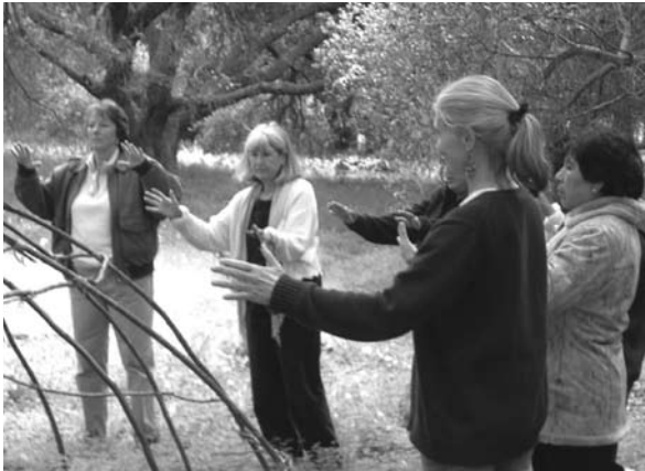
Santa Barbara, California