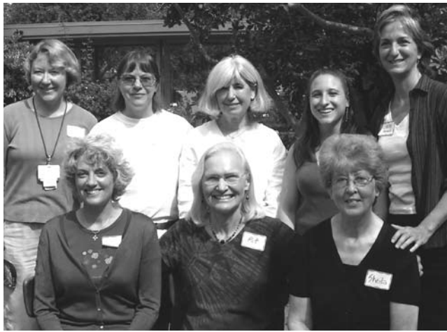
2006 Board & Staff—Capacitar International