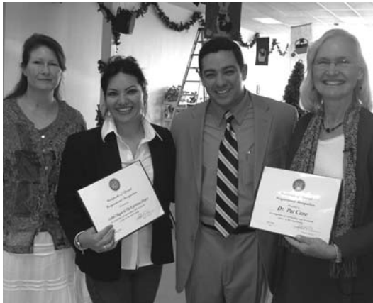
El Paso, Texas