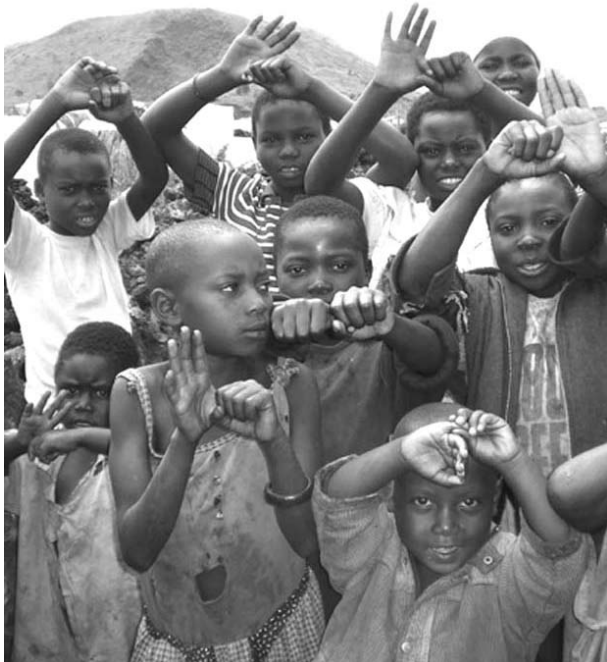
Congo DRC refugee camp: Children learn fingerholds for emotions.

Over recent months Capacitar trainers have brought hope and healing to many places. The following reports describe work that has been done.