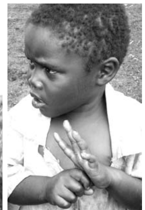
Healing the Generations: Women victims of violence learn Capacitar practices with their children in Goma Refugee Camp, Congo DRC. (Top) A Congolese refugee child plays the fingerhold game to heal his emotions and trauma.