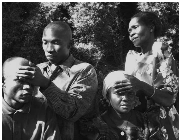
Uganda: Headholds alleviate headaches, flashbacks, violent memories and emotional pain.

El Paso/Juarez A training sponsored by Centro Mujeres Esperanza started in January with 34 participants from El Paso, Juarez, Chapparral, Fort Hancock, Ruidoso and Anthony. A training will also be offered in Juarez hosted by the SSSF Franciscan community. In the first 3 weeks of January, 140 people had already been killed in Ciudad Juarez, and the drug cartel brutality continues to mount daily at the border and throughout Mexico.