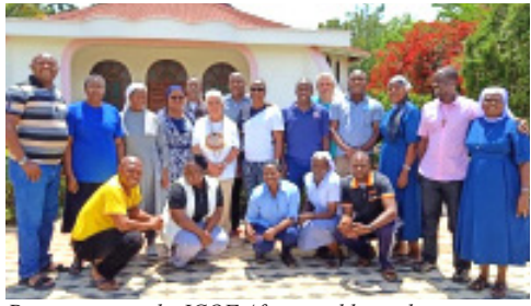
Participants in the ICOF African sabbatical program