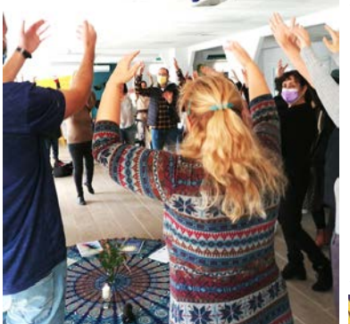
Tai Chi for high school teachers in Israel