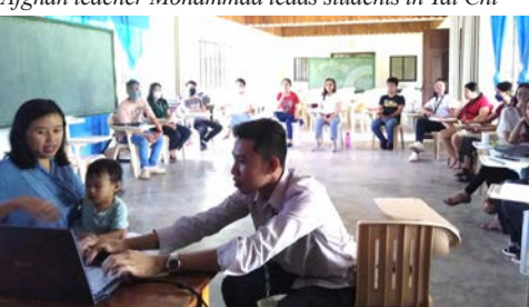
Capacitar class at the Farm School in the Philippines