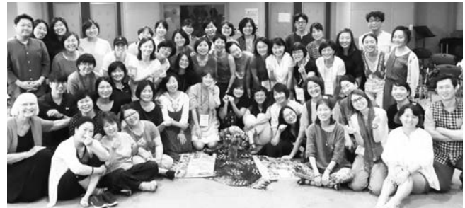
South Korea: Training with the Center for Nonviolent Communication