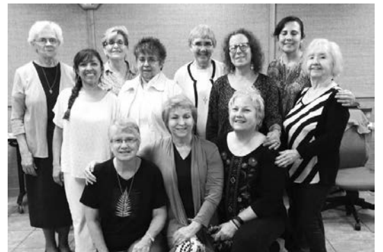
Texas: San Antonio training for participants working with refugees and community groups