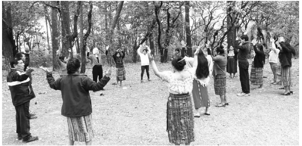
Guatemala: Training at the Barbara Ford Peace Center for Mayans working to heal gender violence in Quiché