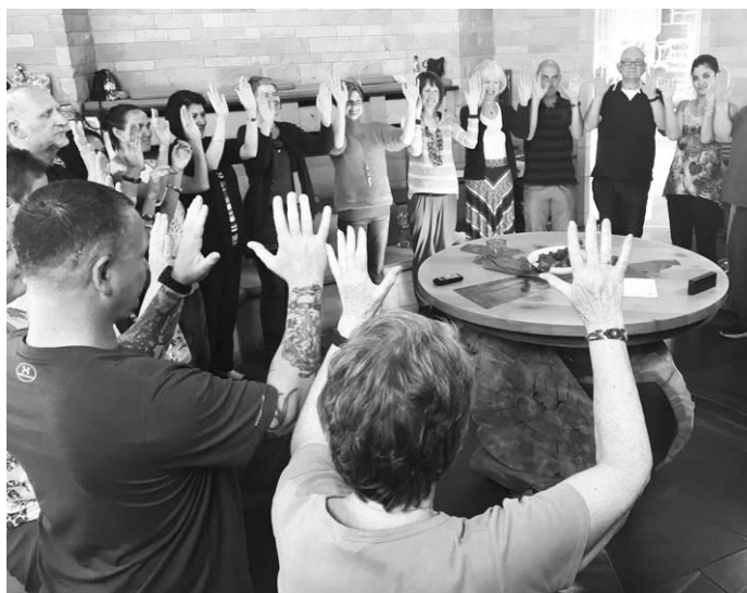
England: Capacitar training at St. Antony Priory in Durham