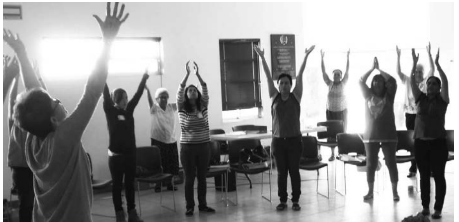
Mexico: Training for community leaders and human rights workers in Ciudad Juarez