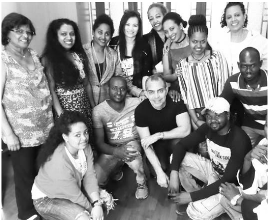
Lebanon: Workshop at a migrant center in Beirut