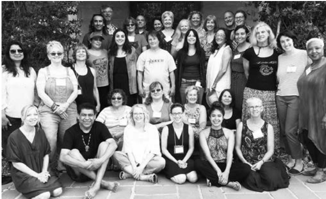
California: Training at La Casa de Maria, Santa Barbara