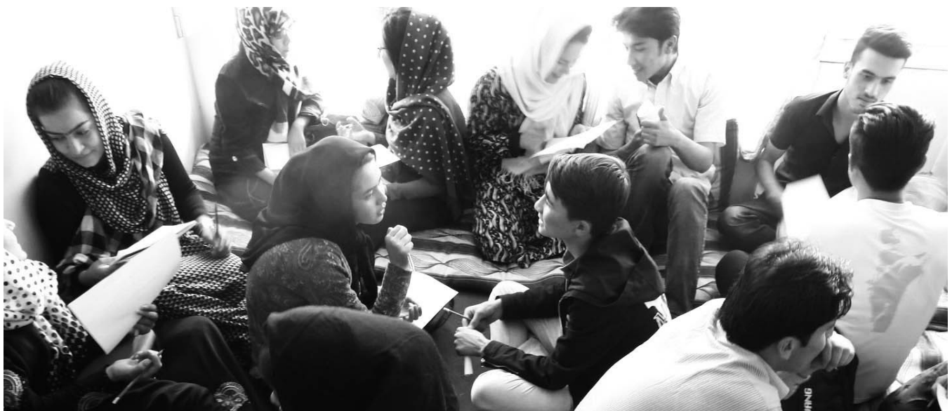
Afghanistan: Capacitar training for Afghan Peace Volunteers and the Borderfree Community in Kabul

Capacitar International Founder/Director