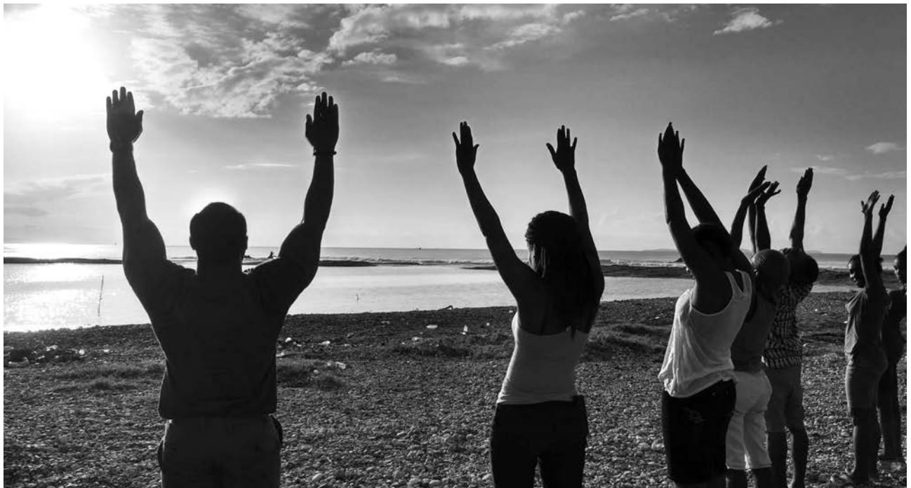
Haiti: Capacitar Haiti men and women doing Salute to the Sun on the beach near Les Cayes where last year's hurricane devastated the area.