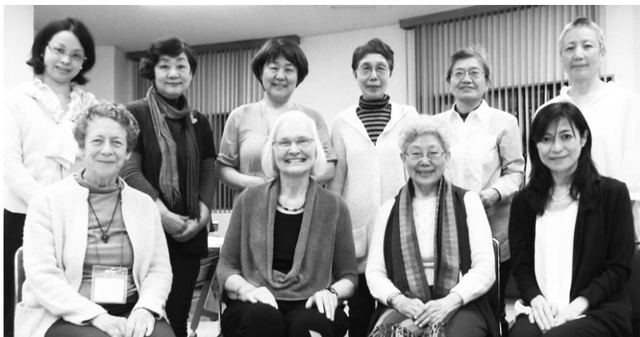
Japan: Capacitar Japan team, advisors and translators at the Tokyo training