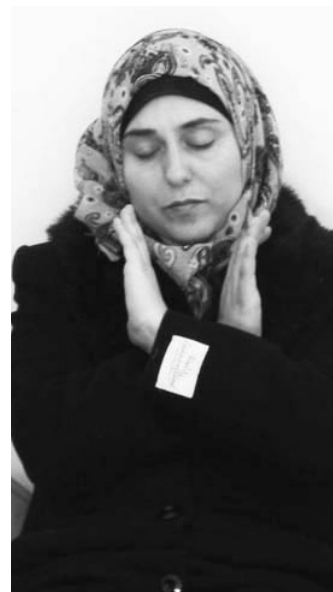
Palestine: Beit Jala training