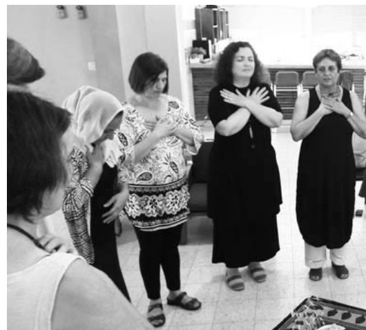
Israel: Capacitar Middle East training