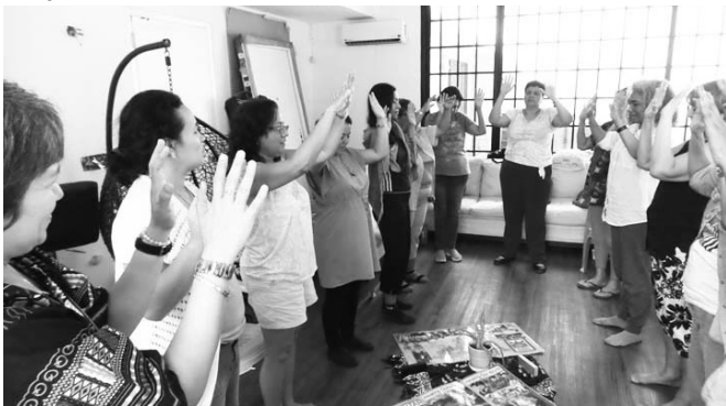
Panama: Advanced training for Capacitar Panama network