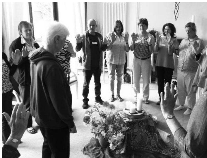
Scotland: Capacitar Scotland Network gathering at The Bield in Perth