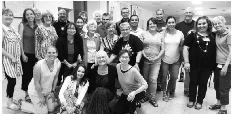
Texas: El Paso training for those working in detention centers, with refugees and at the border