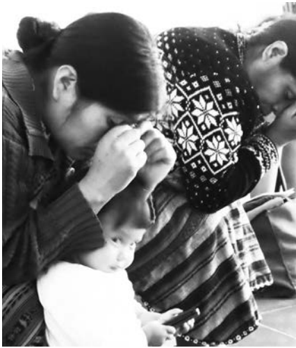
Guatemala: Acupressure for health promoters