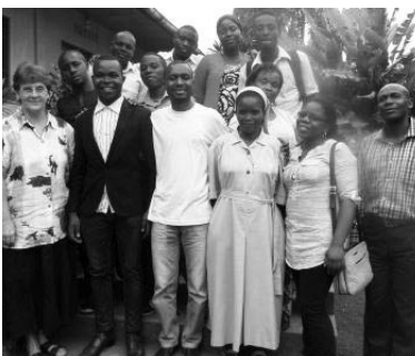
DR Congo: Capacitar North Kivu team