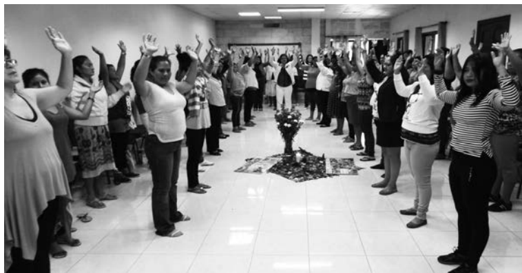
Honduras: 65 Human Rights Defenders at the Capacitar training in August