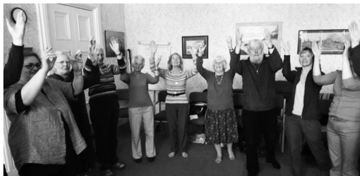
Wales: Training for carers at Noddfa in Penmanmawr