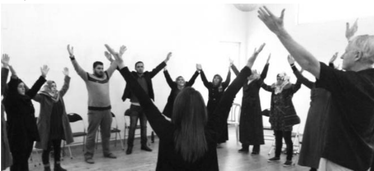
Palestine: Training hosted at the wellness center Beit Shams near Bethlehem