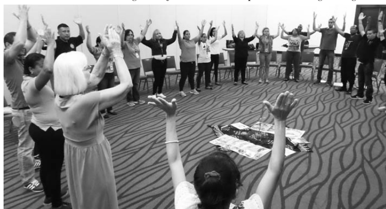
Panama: Tai Chi for INAMU Women's Institute working to heal gender violence