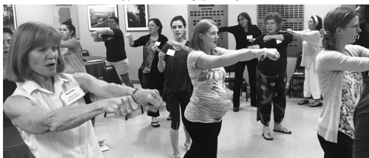
Tucson, AZ: Catalina Rotary-funded training for those working with children