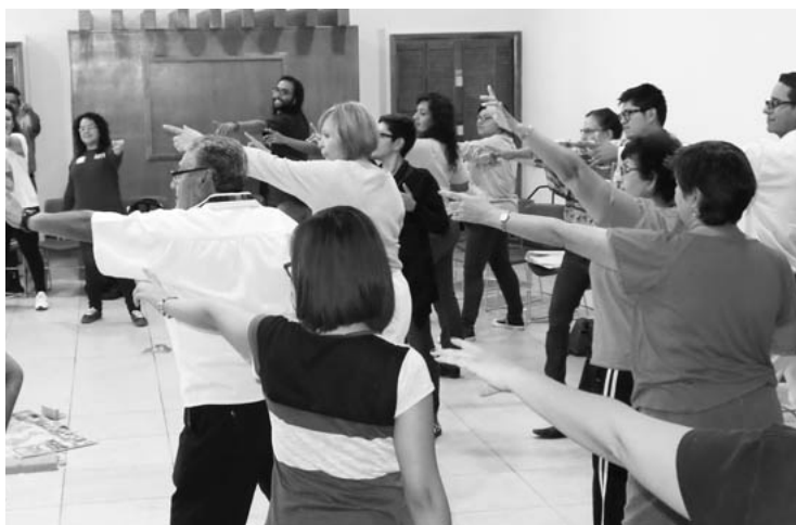
Juarez psychologists and HR defenders practicing Capacitar exercises