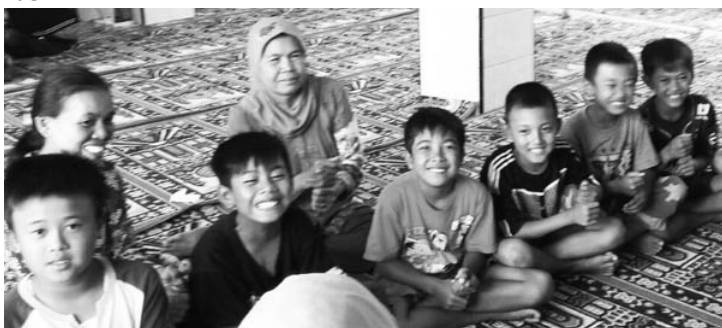
Indonesia: Children learn the Fingerholds at a local school