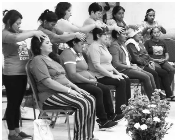
Honduran human rights defenders taking time for self-care

Capacitar International Founder/Director