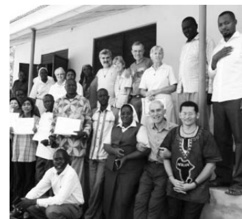
South Sudan: Diocesan Training