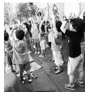
Israel: Tai Chi for Haifa children