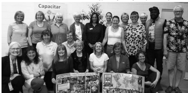
Scotland: Training for participants from Perth, Glasgow, Edinburgh, Aberdeen