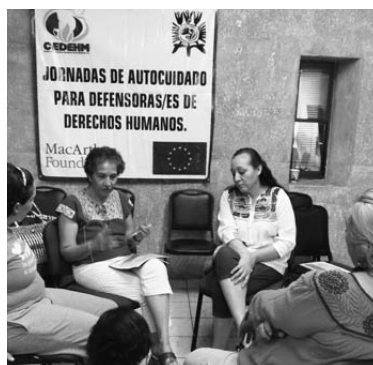
Chihuahua, MX: Human Rights defenders