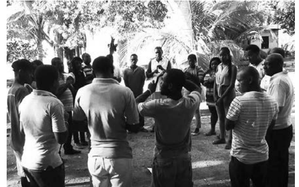
Capacitar Haiti trainer teaching the Fingerholds