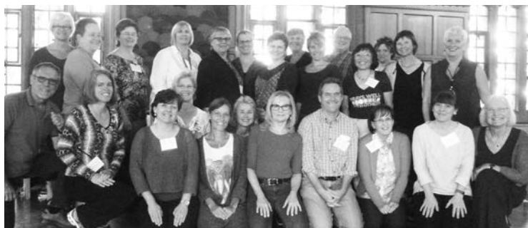
Canada: Toronto training for ministers, psychologists, social workers, carers