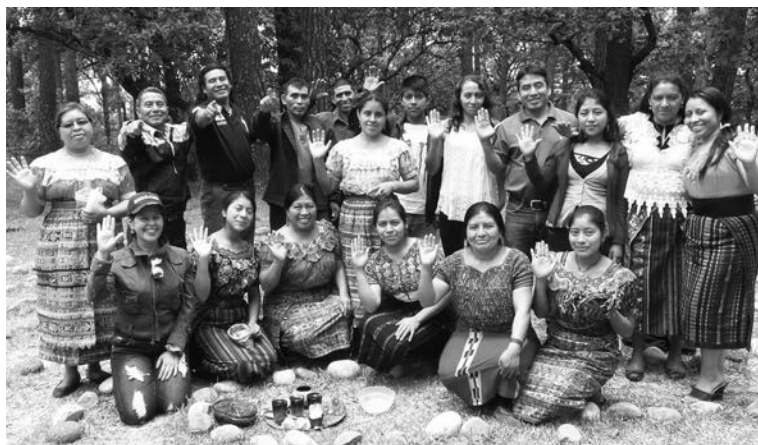
Guatemala: Health promoters in Quiché send greetings and gifts to Afghanistan