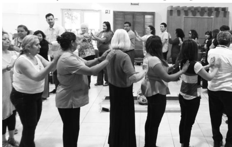
Mexico: Drum Massage for HR defenders and psychologists in Ciudad Juarez