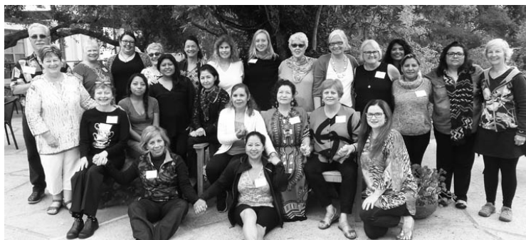
Santa Barbara, CA: La Casa de Maria training