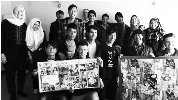
Afghanistan: Border Free Nonviolence Community at a Capacitar workshop

During 2016, Capacitar offered trainings to nearly 3,000 people in the USA, Canada, Mexico, El Salvador, Honduras, Guatemala, Nicaragua, Panama, Haiti, Ireland, Northern Ireland, Scotland, England, Wales, Israel, Palestine, Afghanistan, Japan, Indonesia, Rwanda, Tanzania, Kenya, DR Congo, Uganda and South Sudan. Welcome to the Capacitar global family!