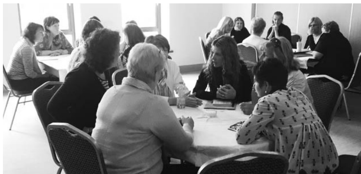
Ireland/Northern Ireland: New training for 46 participants from all of Ireland