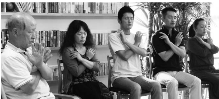
Japan: Tsunami survivors in Ishinomaki practice hand positions for protection