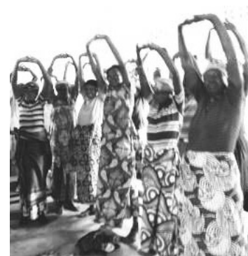
Rwanda: Health carers in Kirambi