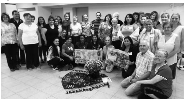
El Paso, TX: Training for those working with refugees and border issues