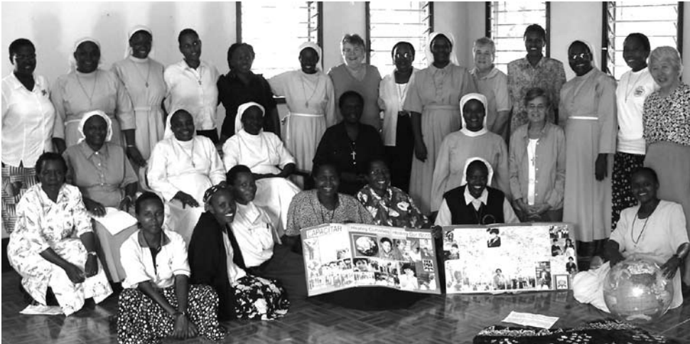
UGANDA: Inaugural workshop for teachers, school administrators, nurses, directors of hospitals & clinics, counselors, psychologists, religious, and groups working with widows and HIV/AIDS—Jinja, August 2009