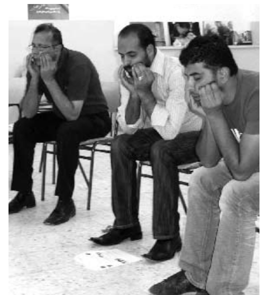
BETHLEHEM, AIDA CAMP: Acupressure with Palestinian teachers and social workers of the Aida Camp community center—October, 2009