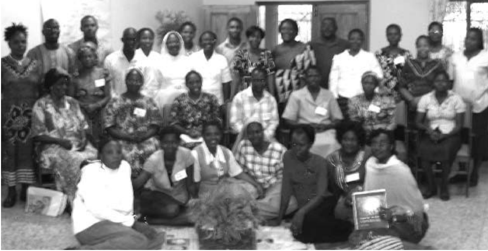
NIGERIA: Trauma Healing Training for HIV/AIDS workers, counselors, teachers, community workers, nurses, doctors and medical professionals —Benin City, July 2009