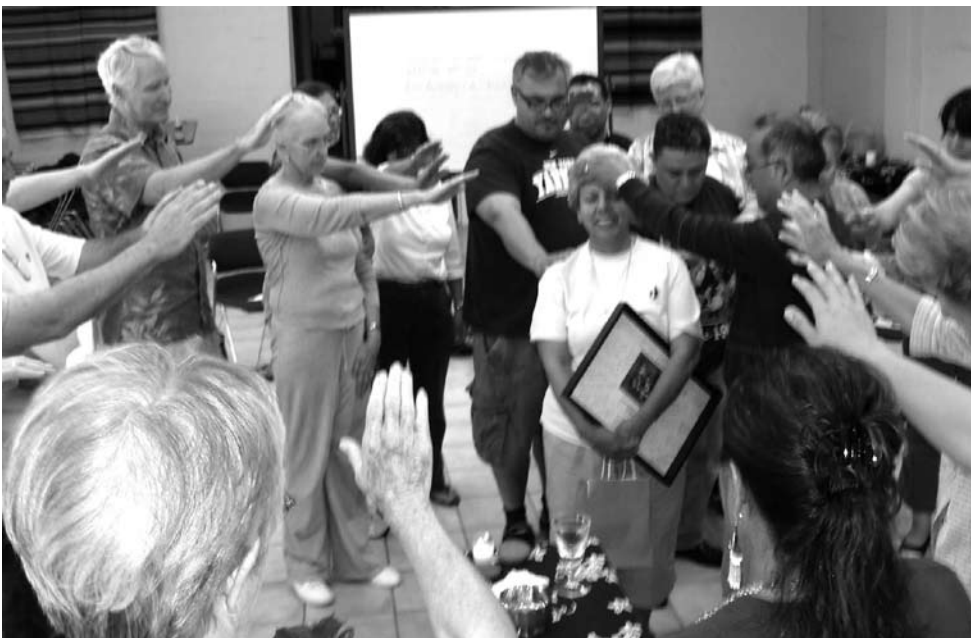
LOS ANGELES, CA: Restorative Justice directors, chaplains and staff at a Capacitar retreat focused on self-care —Malibu, September 2009