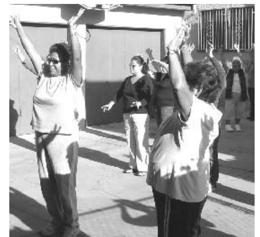
WATTS, CA: Daily Tai Chi and Capacitar practices at the Presentation Learning Center