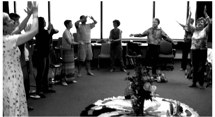
Winnipeg, Canada—University of Winnipeg Graduate School of Theology