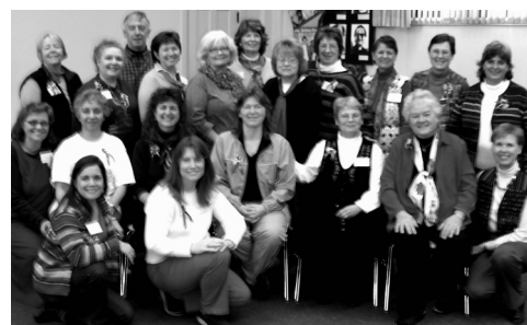
Milwaukee, Wisconsin—Center to BE, 6th MWE training