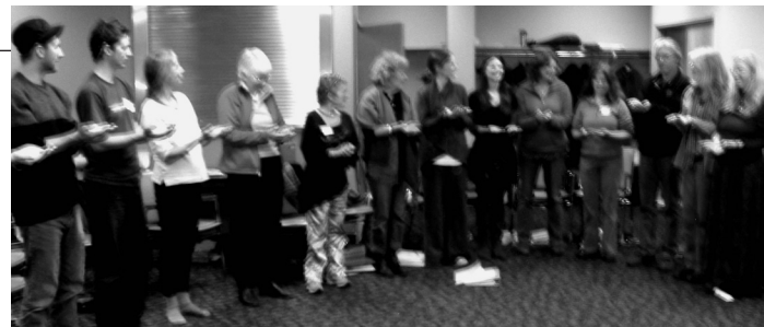
Victoria, Canada—Inaugural Multicultural Wellness Training