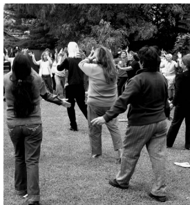
Argentina—Los Cerezos, Buenos Aires