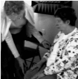
Las Vegas NV—Stillpoint, trauma workshop