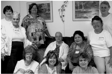
Virginia—Appalachia training, Sunrise Center