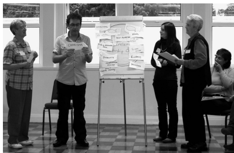
Ireland/Northern Ireland—National team tutor training