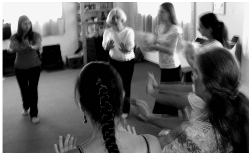
Nazareth—Israeli/Palestinian teens, Women in the Center