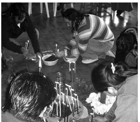
Quiché, Guatemala—Mayan mental health team