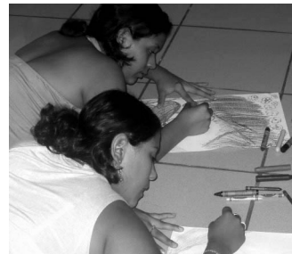
Nicaragua—Cantera spirituality workshop