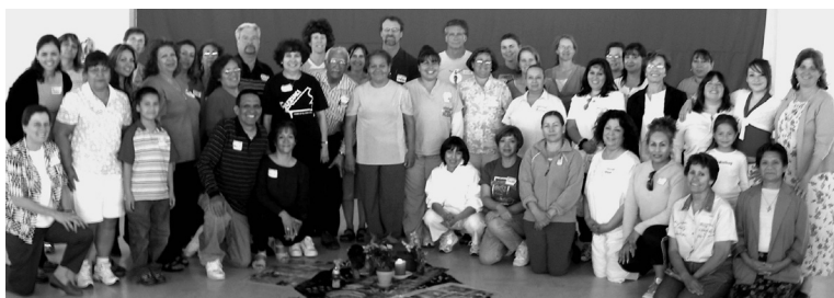
El Paso, Texas & Juarez, Mexico—Community workshop sponsored by Centro Mujeres Esperanza