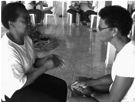
Rio, Brazil—Multicultural Wellness Training