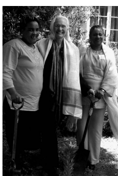
Trauma Centre—Cape Town