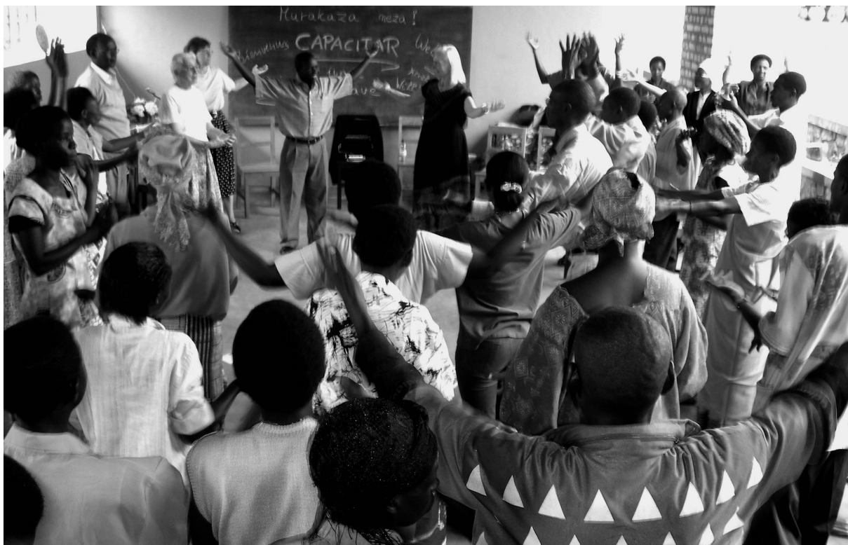
Leadership dance at a workshop for community leaders, genocide survivors, caregivers and people with HIV/AIDS— Rwanda 2007