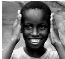
Bujumbura, Burundi—HIV orphan