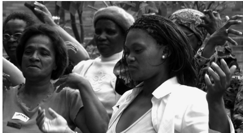
Port Elizabeth, South Africa—CARE, HIV/AIDS Caregivers