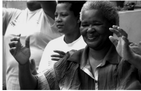
South Africa—PE, AIDS Caregivers