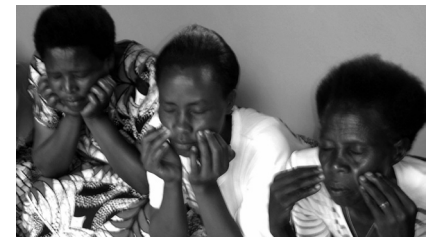
Save, Butare, Rwanda—HIV/AIDS caregivers