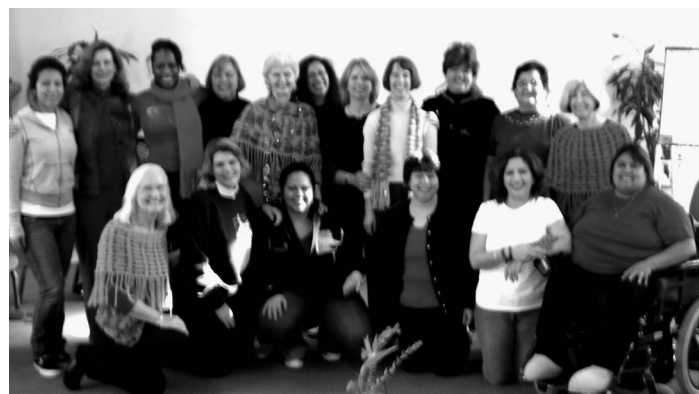
Santa Barbara, CA—La Casa de Maria training