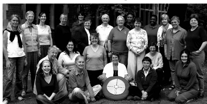
Hammersmith, England—Inaugural Multicultural Wellness Training