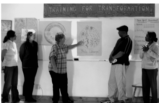
South Africa—National training & team development