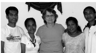
East Timor—National team