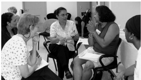
East Harlem, NY—Spanish/English Wellness Training