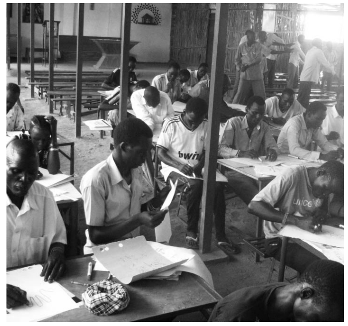
South Sudan: Teachers learning Capacitar methods in a training program

In Old Fangak, 75 teachers completed Year I of a 4-year government teacher in-service program. This is one of 14 emergency locations where Capacitar was taught daily by 1000 teachers. Barbara taught and supervised the teachers for a month before they went out to teach unqualified teachers. Barbara also supervised some teachers in the 'deep field' remote areas.