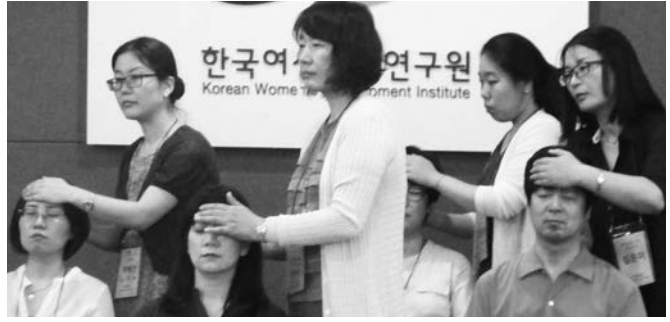
Participants share a head hold for trauma at the training in Seoul-June 2015

To respond to the national tragedy Capacitar was invited to lead trauma healing and self-care trainings in collaboration with the Korean Center for Nonviolent Communication in Seoul. Over 330 men and women came to the Capacitar trainings and presentations. Participants included members of the nonviolent communication community, facilitators, university professors, teachers, psychologists, social workers, religious, trauma counselors, nurses, medical professionals, police, those working in restorative justice, persons working to heal sexual and gender violence, and community leaders. Dates are set for followup Capacitar trainings for Korea in July, 2015.