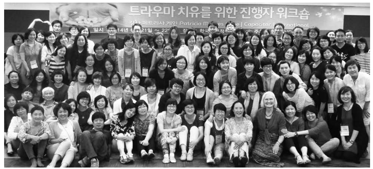
The Capacitar 2-day training for 150 participants representing many Korean grassroots and community organizations