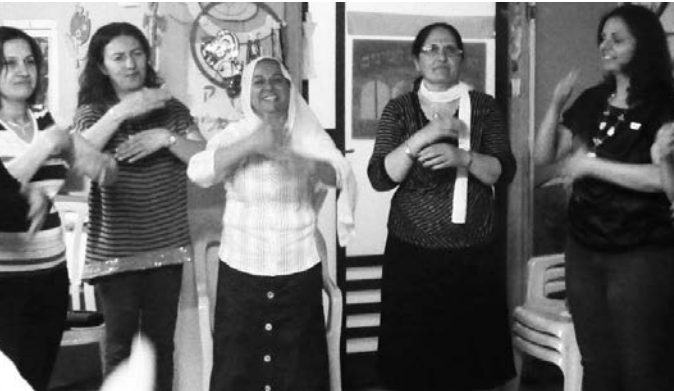
Capacitar advanced training group with Jews, Christians, Druze and Arab women—Israel