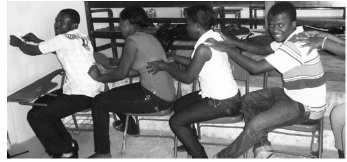
Training for men and women in Belosse, a violent area in Port Au Prince, March 2014

Capacitar International Founder/Director