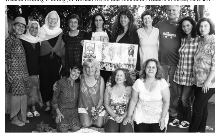
Capacitar Middle East Network advanced training in Osafia, Israel, June 2014