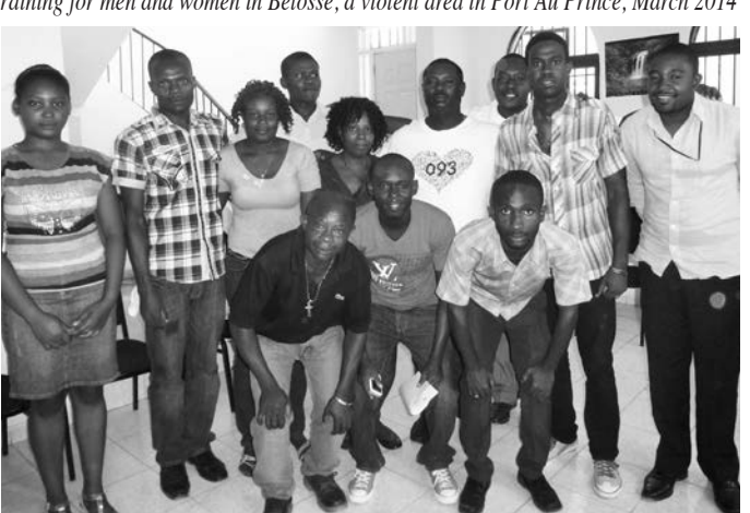
Capacitar workshop sponsored by the Federation of Haitian Mayors, June 2014