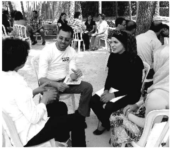
Nurses, administrators and staff of Holy Family Hospital, Bethlehem

with each other. One spoke of the effects of trauma on her first child who cannot concentrate at school. We were all touched by a woman whose brother (a father of 7 children) was killed in Juba during the workshop. She heard about it at the end of the second day. His body had already been brought back home and buried. The woman said she would continue with the training because she was committed to peace. What she was learning would help her to help her family and community. Everyone expressed their gratitude for the training. One said: I now know I can heal, and have hope to be able to help my husband and children.