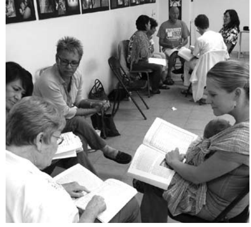
EL PASO, TX—JUAREZ, MEXICO: With a cross-cultural focus, participants learn Capacitar skills as they live and work in the midst of border poverty, trauma, and ongoing drug cartel violence, June 2010.