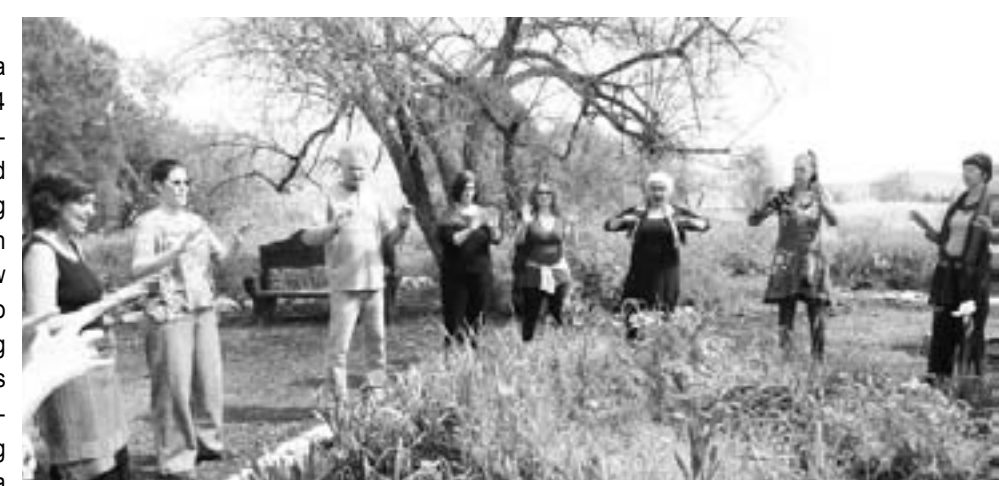
Jews, Christians, Muslims and Druze share a walking meditation at the second Capacitar training in the Upper Galilee.