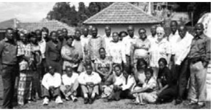
Human rights defenders at a workshop sponsored by Amnesty and Protection International

Workshop participants were very receptive to the approach of Capacitar and quickly recognized how the simple practices brought relief and healing. They said the techniques would be very important for themselves and for their families to manage daily traumatic stress. Participants also expressed the desire to have Capacitar take root in the Kivu region, as well as in the whole of the Congo.