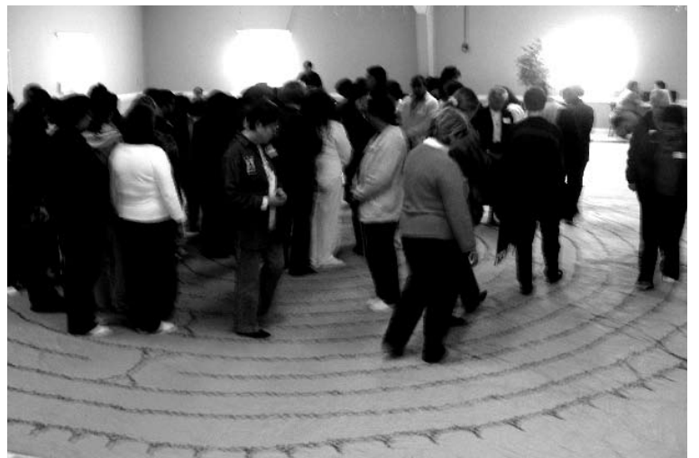
Women from Texas, Arizona, New Mexico and Juarez walk the labyrinth at a training sponsored by Centro Mujeres de la Esperanza, El Paso, TX.