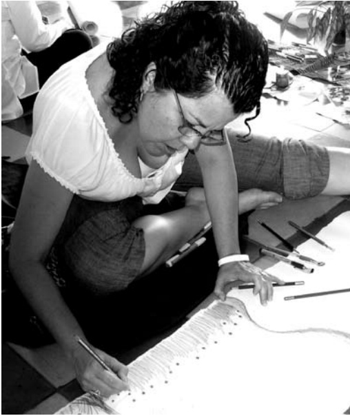
River of Life at the Capacitar training in El Salvador