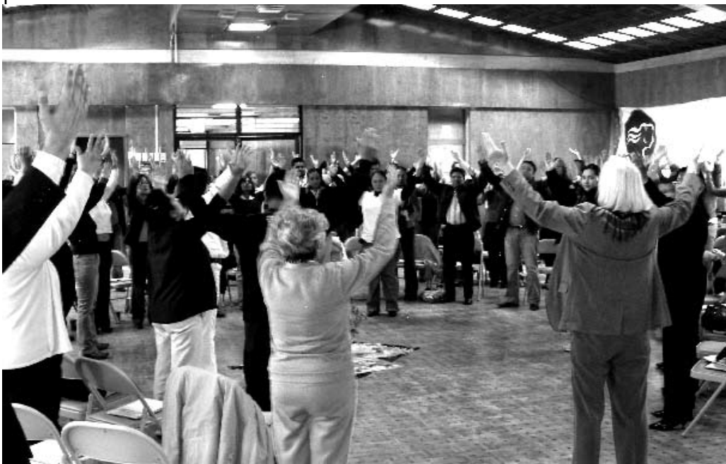
Mexico 2009—Capacitar trauma healing workshop for psychologists, social workers and community leaders of Ciudad Juarez

At this time when the human family faces overwhelming challenges everywhere, we are reminded of the words of Clarissa Pinkola Estes who encourages us to reconnect with the light that is already within us and to share this with others: "The light of the soul throws sparks, can send up flares, builds signal fires, causes proper matters to catch fire. To display the lantern of the soul in shadowy times like these—to be fierce and to show mercy towards others, both are acts of immense bravery and greatest necessity. Struggling souls catch light from other souls who are fully lit and willing to show it!" In the words of Judy Cannato in Radical Amazement : "To be spark throwers, to send up flares, to be fierce with fire—that is what our world so desperately needs from us!"