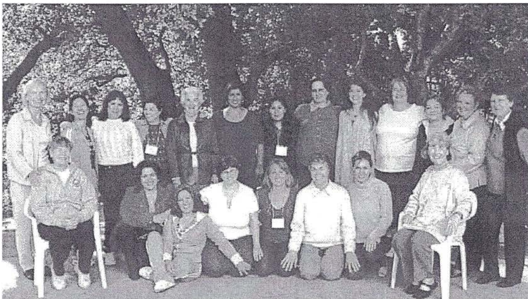
Left: La Casa de Maria participants of the 2005 Multicultural Wellness training