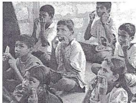
Bottom: Tamil orphan and refugee children learning the Emotional Freedom Technique.