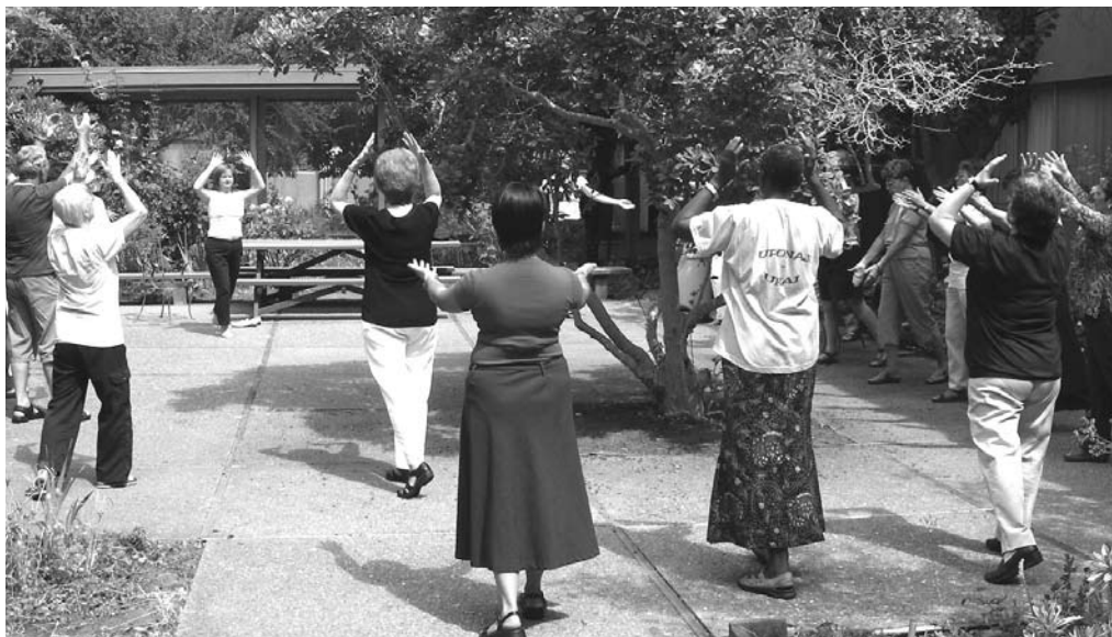
Left: Celebrating a global gathering of Capacitar with 22 team leaders and board members from Tanzania, Ireland, Argentina, Guatemala, Indonesia, Texas/Mexico border communities and different parts of the U.S.—Sophia Center Holy Names University, Oakland, CA-July, 2006