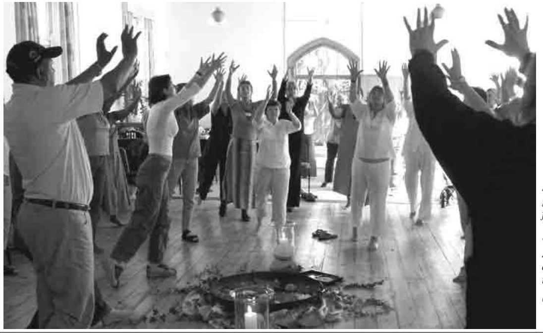
South African grassroots leaders from Eastern and Western Capes working to heal AIDS, violence and trauma in their country October, 2005

In simple yet profound ways many of the people with whom Capacitar walks are exemplars of compassionate presence and discerning wisdom in the midst of the chaos of life. AIDS Caregivers in Swaziland and Botswana are transforming what it means to live in wellness as they accompany the dying. In both countries the HIV rate of infection is nearly 40% of the population. Counselors in Cape Town help families heal the violence of their townships, where children duck bullets on their way to school. Trauma workers in Belfast and Newry, Northern Ireland use the Capacitar skills in family centers, schools, and victims groups. And staffs in Santa Barbara County, CA are applying Capacitar methods in alcohol, drug and mental health programs with communities at risk. We are reminded of the words of Margaret Mead: "Never doubt that a small group of committed citizens can change the world. Indeed, it's the only thing that ever has." As we celebrate this season of light transforming the darkness, may each of us offer our unique gift to enlighten and transform the present darkness.