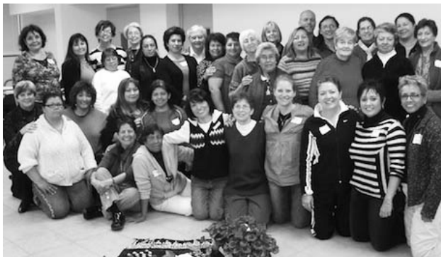
Capacitar en la Frontera training with participants from El Paso & Juarez

Capacitar International Founder/Director