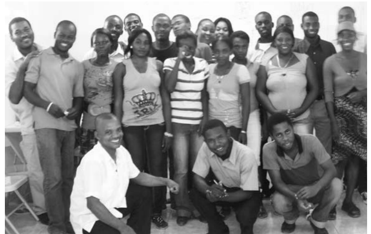
CEDDISEC participants at a Capacitar training in Port au Prince, Haiti

The July training at CRAD included 34 men and women from both urban and rural areas, and 32 women, mostly from rural areas, participated at ODELPA. A second module was held in November for each of these groups and a third is planned for early 2013. Also in July, 24 young people from CEDDISEC gathered at St. Pierre's College in Port Au Prince for a workshop that was tailored to give them tools to use in their outreach work. Thousands of people left homeless after the January 2010 earthquake still live in tent camps and, along with others living in sub-standard housing on denuded hillsides, suffer additional losses each time there is heavy rain, as with the recent Hurricane Sandy.