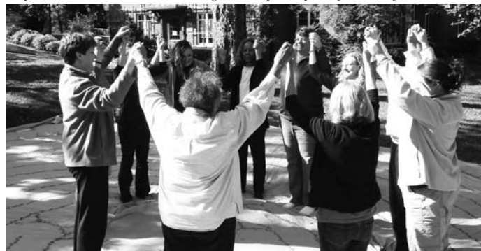
Training at Transfiguration Spirituality Center, Cincinnati, Ohio