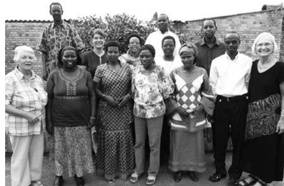
Capacitar Rwanda national advisors at a planning meeting