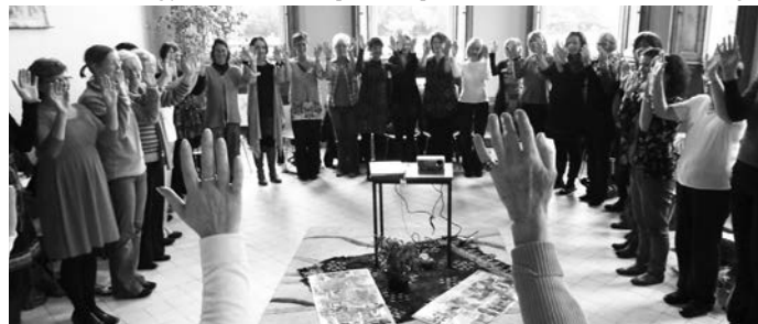
Capacitar Ireland advanced training with 40 participants from all of Ireland