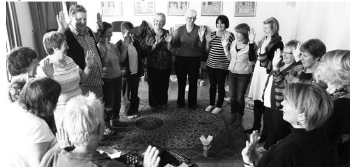
Scotland training for teachers, therapists, chaplains and social workers, Edinburgh