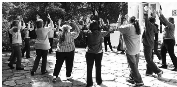
Training reunion at La Casa de Maria, Santa Barbara, California