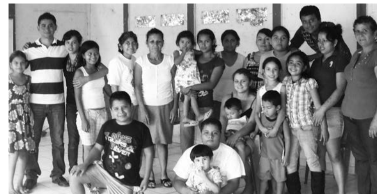
Capacitar El Salvador training for Aguacayo families and youth, Cuscatlán

In September, I met with the Capacitar El Salvador team and visited their training project in two rural communities in the department of Cuscatlán. In El Barío they have two groups: for women and youth. In Aguacayo, there is a mixed group. An 8-week program offered Capacitar practices for dealing with the stress and trauma of post-war El Salvador in repopulation communities. Problems leading to stress are the increase in gang pressure on youth, along with a difficult economy where many youth are not able to find work and where women and men struggle to meet the needs of their families. Many are also affected by intergenerational trauma from their families' experiences in the civil war that ended in 1992. The team will begin a third series of workshops in November in Suchitoto and plan to expand outreach with workshops in the greater San Salvador area.