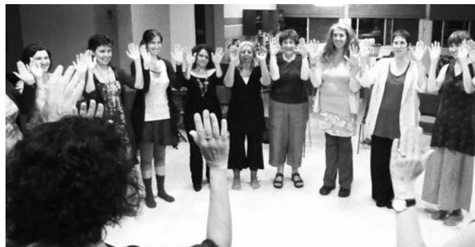
Capacitar Middle East training with Jews, Christians, Muslims and Druze