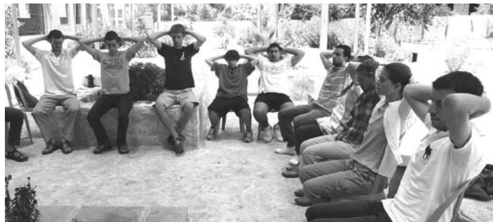
Palestinian & US youth learn Capacitar skills for work in peace and nonviolence