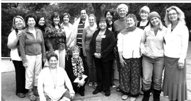
La Casa de Maria, Santa Barbara, CA has hosted trainings since 2003