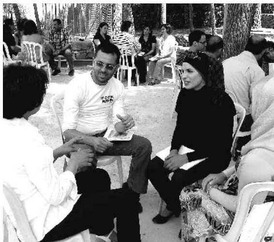
Nurses, administrators and staff of Holy Family Hospital, Bethlehem

with each other. One spoke of the effects of trauma on her first child who cannot concentrate at school. We were all touched by a woman whose brother (a father of 7 children) was killed in Juba during the workshop. She heard about it at the end of the second day. His body had already been brought back home and buried. The woman said she would continue with the training because she was committed to peace. What she was learning would help her to help her family and community. Everyone expressed their gratitude for the training. One said: I now know I can heal, and have hope to be able to help my husband and children.