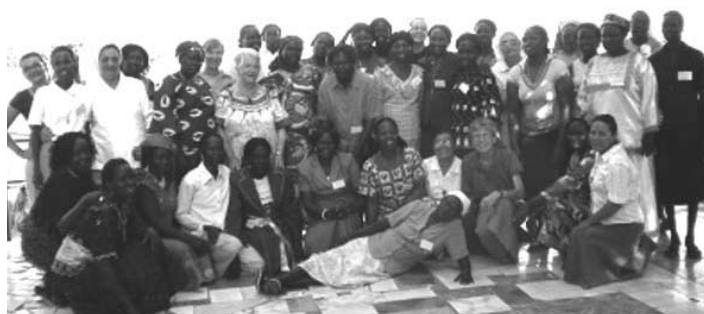
Women planting seeds for peace in Southern Sudan

Capacitar International Founder/Director