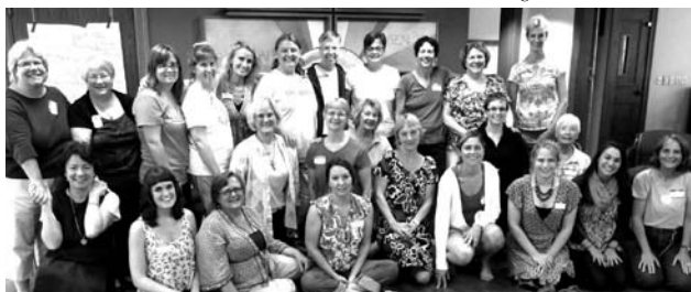
Transfiguration Spirituality Center inaugural group, Cincinnati, OH 2011

In the Santa Barbara training at La Casa de Maria, one woman is a professor of education at UCSB and also directs educational programs for her Chumash Reservation. Another woman from Argentina works with Hospice as well as with the Hispanic community in Santa Cruz. Two principals are also participating—one directs a charter school in Santa Barbara, another heads an elementary school in Camarillo. In our Cincinnati inaugural training at Transfiguration Center, participants come from four states. Two women work with the Cincinnati YWCA shelter and one woman is a social worker at Tender Mercies, a project for the homeless. Two professors come from the Theology Department at Xavier University, and a professor of education and disability comes from Kentucky. Two women represent Hearts for a Safe Harbor, a nonprofit working with former child soldiers and youth in Gulu, Uganda. Because of the wide range of experience, exchange among training participants is rich and empowering.