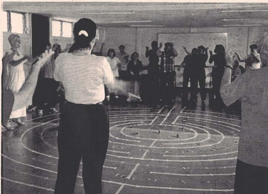
Celebrating the Labyrinth at CANTERA—Managua, Nicaragua, June 1998

WE ARE AS LARGE AS OUR LOVES. . . THE PROPHETIC OPTION FOR A BIOCENTRIC ETHIC TRANSFORMS US TOWARD GREAT-HEARTEDNESS, PLACES US IN RESONANT COOPERATION WITH CREATOR Spirit. WE ARE EMPOWERED TO BECOME SISTERS AND BROTHERS, FRIENDS AND LOVERS, GARDENERS AND STEWARDS, ADVOCATES AND POETS, COLLEAGUES AND FELLOW DANCERS, CO-CREATORS AND CHILDREN OF THE WORLD THAT GIVES US LIFE!