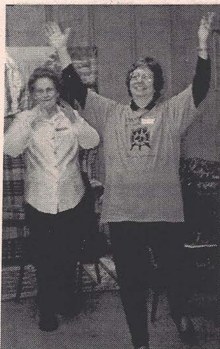
Appalachian women at Sunrise Center—Richlands, Virginia