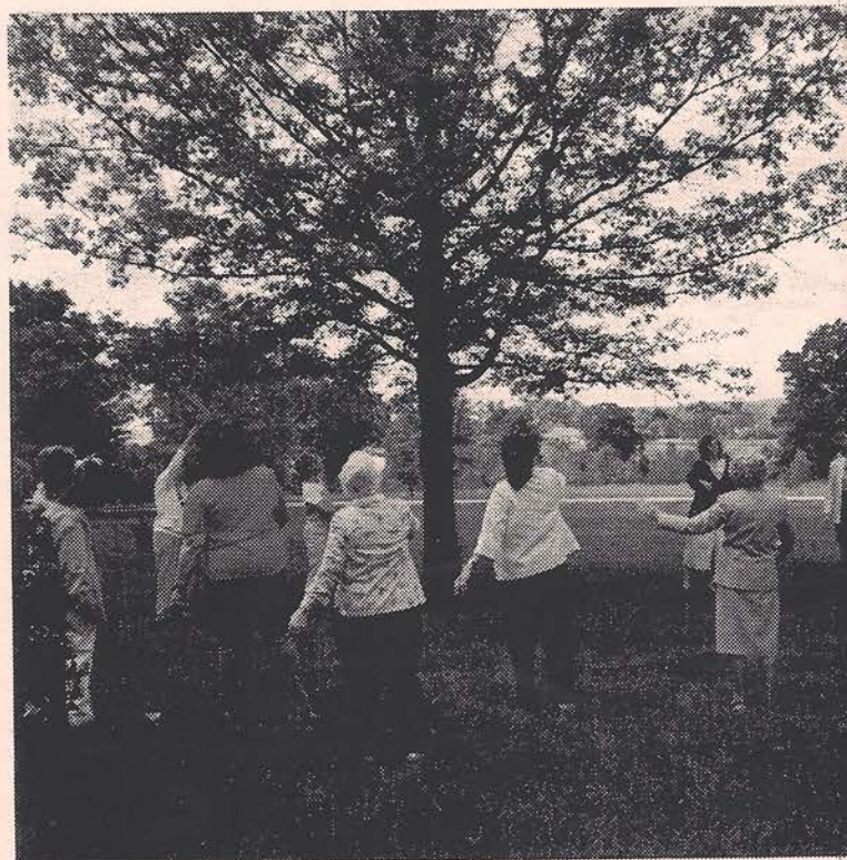
Tai Chi at Catherine Spalding Center—Nazareth, Kentucky