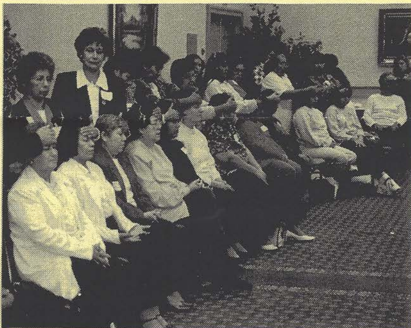
Mexican delegation learn seated massage and breathing meditation

Above: Pal Dan Gum exercises to open energy channels and release stress.