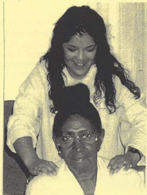
ABOVE: African American and Mexican women sharing a CAPACITAR workshop at a Mercy-sponsored workshop, Franciscan Center, Carey OH October, 1997