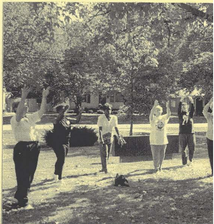
Mercy-sponsored workshop in Louisville, Kentucky October, 1997