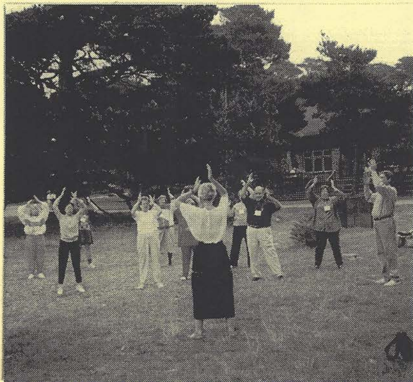
CAPACITAR-Tai Chi—Methodist Ministers' Conference, Asilomar September, 1997