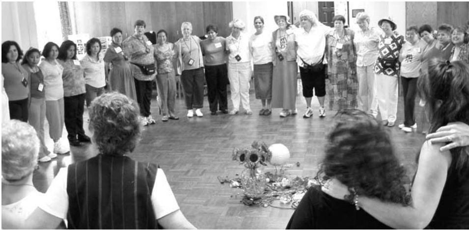
Capacitar National Gathering in San Diego, CA—Summer 2004

Casa de Maria developed retreats for Hispanics, along with bi-lingual MWE trainings for Southern California. In Northern California St. Anthony's Foundation established MWE trainings in San Francisco. In Canada MWE programs and workshops were scheduled for Victoria, Winnipeg and Toronto. And at the border with Mexico, bi-lingual MWE trainings have been held in San Diego and El Paso.