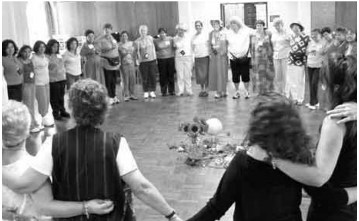
Closing ritual of the first U.S. Capacitar Conference with participants from 10 states, Mexico and border communities—San Diego, CA